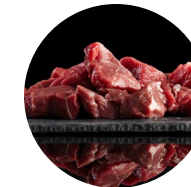
Meat & Poultry